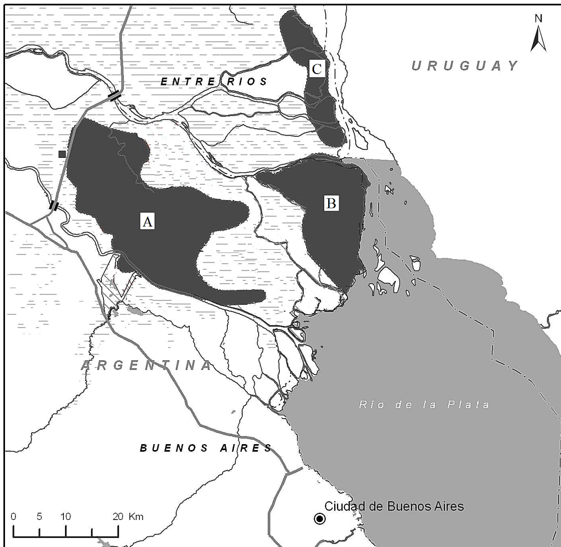
Figure 2. Marsh deer ( Blastocerus dichotomus ) distribution in the lower Delta of the Paraná River. Letters A, B and C represent the three different nuclei proposed for the species in this wetland (D'Alessio et al. 2006).

communicators, and educators from governmental organizations (i.e., the Research Council of Argentina, the National Institute of Agricultural Technology), environmental NGOs (i.e., ACEN - Association for the Conservation and Study of Nature) and forestry companies, implemented an ambitious initiative ("Pantano Project") aimed at diagnosing the conservation status of the species in this wetland and identifying which forestry or silvopastoral practices (i.e., plantation management, water use strategies, cattle density) are most compatible with the deer's continued existence.