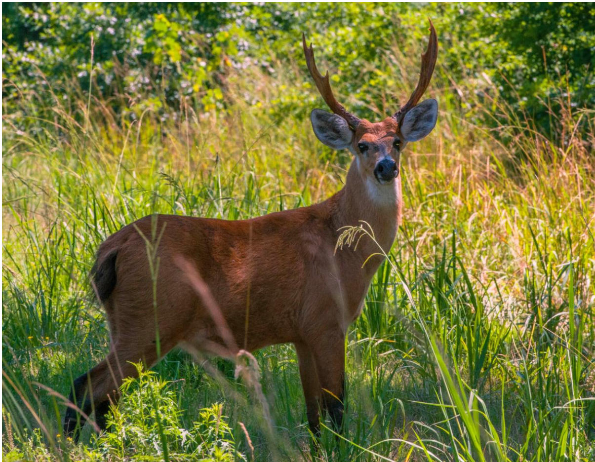
Figure 1. Marsh deer ( Blastocerus dichotomus )

core" (with almost all individuals within forestry properties) and the third on a strip of islands near the Uruguay River, in Entre Ríos province (Varela 2003; D'Alessio et al. 2006). Under this scenario, initiatives, including the creation of protected areas (i.e., the MAB-UNESCO Delta del Paraná Biosphere Reserve, with c. 900 km 2 ), dissemination and awareness activities among islanders, and control to reduce poaching, were taken to conserve the deer in the region (Aprile et al. 2006, D'Alessio et al. 2006). These actions were designed opportunistically and their real impact on marsh deer conservation was not evaluated due to the lack of reference data about this population.