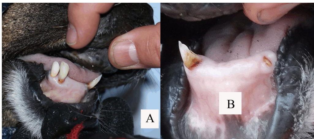
Figure 2. A) Female 3.5 years old with loss of 4 central incisors; gums, though healed over, are receded, exposing roots of remaining teeth; B) Male 4 to 5 years old: only 1 front tooth remains; the right canine is broken and only part of the root of the left canine remains at gum level.

potential lifespan--an estimated \geq 14 -year longevity for their species (Smith-Flueck 2000)-- provide an explanation for the absence of population recovery, and are congruous with the high prevalence of osteopathology evidenced in earlier carcasses collected from this same population (Flueck & Smith 2008). Skeletal remains collected between 1993 and 2007 provided data on bone disease, demonstrating its potential to contribute to morbidity: osteopathy among adults was at least 57%, with affected individuals having mandibular (63%), maxillary (100%), and appendicular lesions (78%). Furthermore, the estimated \geq 14 -year longevity (Smith-Flueck 2000), which was based on comparison of various deer species with known longevity, is low. Instead, when basing an estimate by the body weight (Speakman 2005), we can expect longevity of 26-years for huemul (assuming 100 kg), when using the formula: