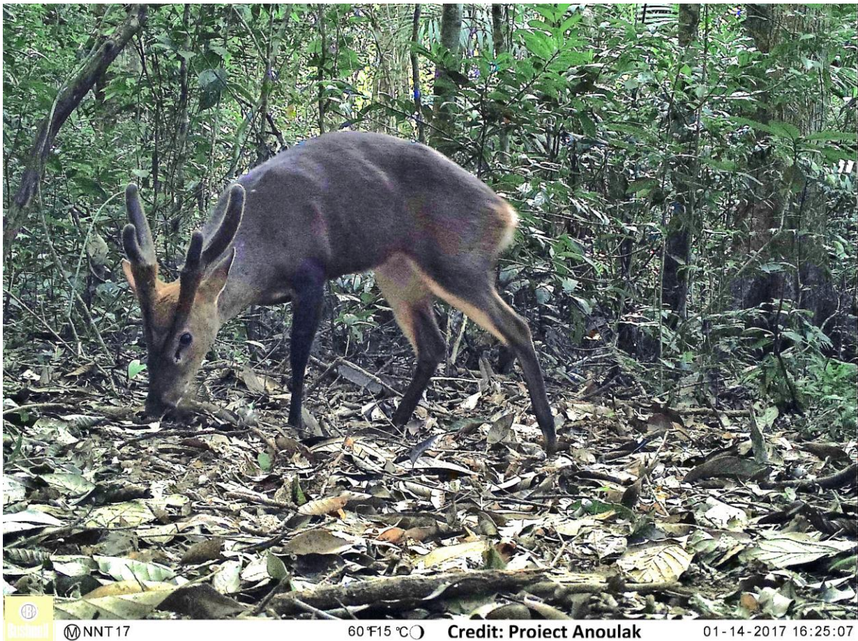
Figure 1. Large-antlered muntjac ( Muntiacus vuquangensis).