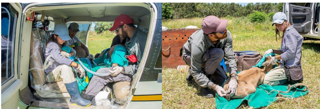
Figure 1. The animals are darted and moved to a pen located in the capture area (right). After 10 days they are moved to the Iberá Park in a helicopter (left).

During November 2017, a new pampas deer translocation into Iberá Park was carried out, for the purpose of reinforcing a second population nucleus which had already been established there. The Iberá Park covers 1,729,737 acres of public lands combining Iberá Provincial and National Parks, which are managed by the Province of Corrientes and the National Parks Administration. The lands that constitute the National Park were donated by The Conservation Land Trust (CLT), which is also carrying out the reintroduction of six species of mammals and birds which became extinct in this huge wetland. One of these species, the pampas deer, is among the most endangered in Argentina, with only four remaining populations, isolated from each other, with 2000 individuals in total.